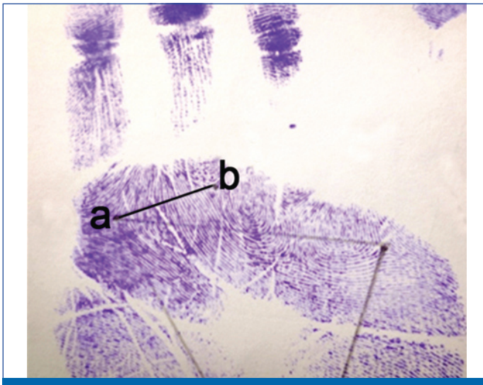
[Table/Fig-2]: a-b ridge count

't' and from this to the triradius 'd' of the fourth inter-digital area [Table/Fig-3]. The numeric value of the 'atd' angle was measured in both hands using protractor.